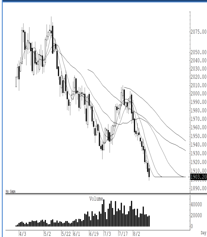
GOU23 (Close 1,903.20 Chg -5.80)

ราคาทองคำโลกอ่อนตัวลงต่อเนื่อง ไม่ข้าม 1,928 ดอลลาร์ น่าจะ sideways down ต่อไป เราแนะนำยกการ์ดสูงหรือตั้ง stop ไว หรือแนะนำ trading ในกรอบ 1,920-1,880 ดอลลาร์ รับรู้กำไร แต่ถ้าในกรณีนี้ที่ปิดต่ำกว่าระดับ 1,879 ดอลลาร์ แนะนำ ถือ short หวังผลปรับตัวลงไปแถว ๆ 1,850 ดอลลาร์ รับรู้กำไร